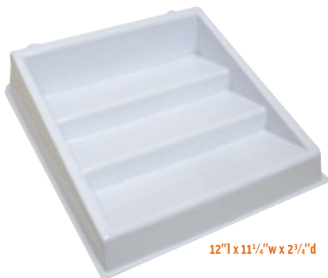
12"l x 11 1/4" w x 2 3/4" d

Small yet effective. 3-tiered steps allow for full product facing by adding height to your product on the counter. Ideal for limited space. Add a riser or header board and create a stunning display for add-on purchases, condiments, demo products, you name it! Call us to custom order.