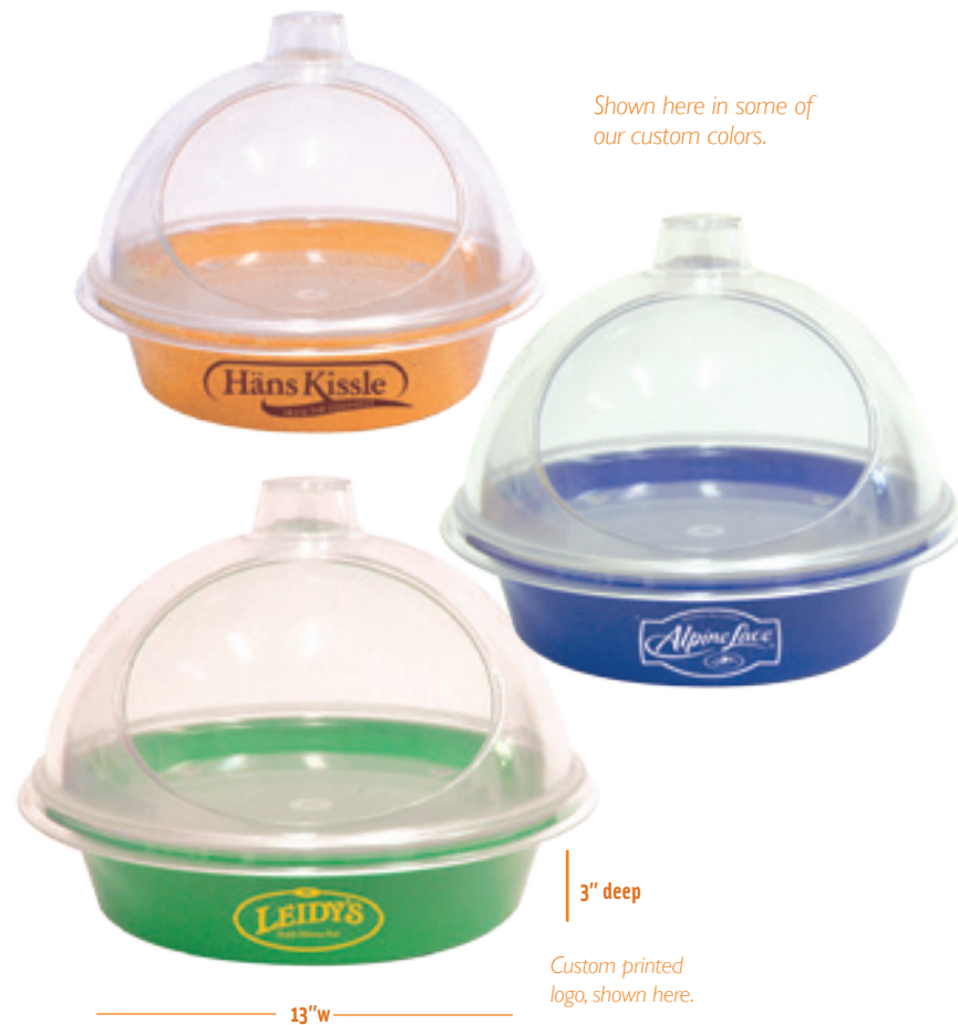
Shown here in some of our custom colors.