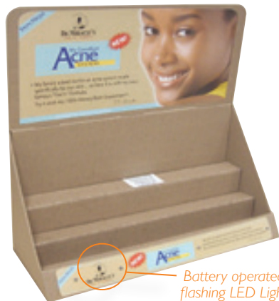
Corrugated 2-Tier Displays with Flashing LED Light

We are not limited to the range of products we produce. If you need a display for Wellness/HABA, Electronics, Music, Beauty, Office Supplies, Jewelry, Liquor, Automotive, etc., we can accommodate you for just about anything you can think of. Here are a few examples of what we can do for you.