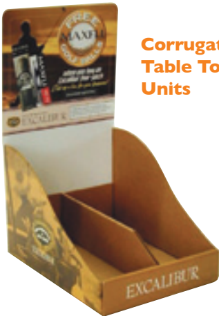
Corrugated Table Top Units