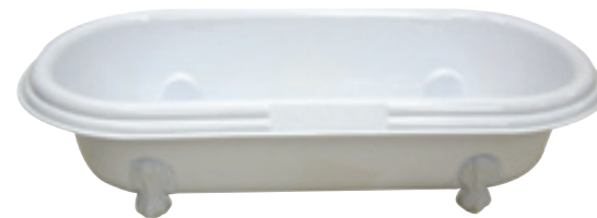
25"l x 12" w x 6" d

A unique way to present your product. Place your logo on the front or use one of our separate clip sign holders (on pages 18-24) for an "eye-catching" counter top display. Great for candy, flowers or whatever your creative juices come up with. Call us for your custom order.