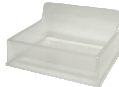
8"l x 6" w x 4" d

Great for counter tops! Attach your header board on back or have us print your logo on front. Perfect for displaying smaller item products. Available by custom order, just give us a call for more information.