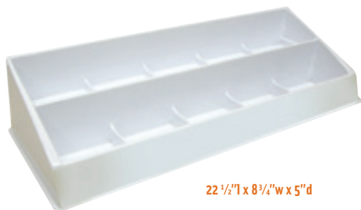
22 1/2"l x 8 3/4" w x 5" d

Limited counter space? Create a full display using minimal product. Add a riser or header & logo sign to create an effective "Grab & Go" display. Available by custom order, give us a call for more information.