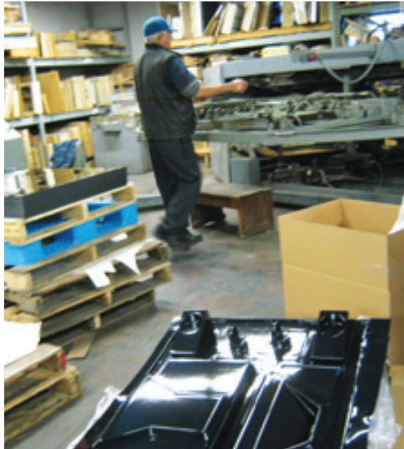
Shown above: One of our many vacuum forming machines. All of our vacuum formed projects are done in-house.

A unique way to present your product. Place your logo on the front or use one of our separate clip sign holders (on pages 18-24) for an "eye-catching" counter top display. Great for candy, flowers or whatever your creative juices come up with. Call us for your custom order.