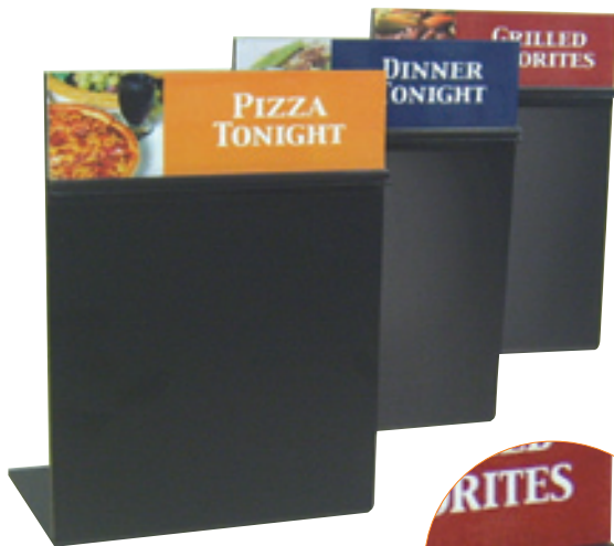
Shown here: Up-close look at paper sign holder Snap Channel.