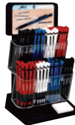
Plastic Counter Merchandisers