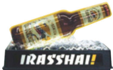
Small Vacuum Formed Counter Displays