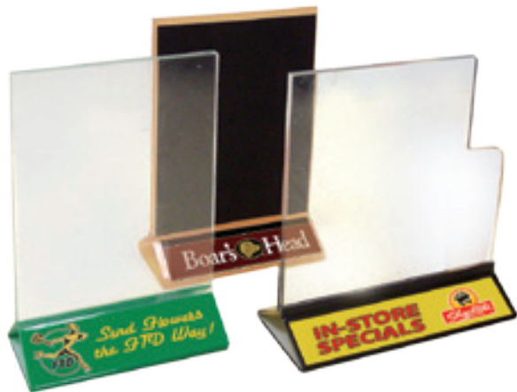
4 1/4" w x 7 1/4" h (Holds 4 1/4" w x 6" h Paper Signs)

Our smaller-sized Plastic Table Tents will help promote your brand and special items when there is limited counter space. Capable of holding up to 4 1/4" w x 6" h paper sign advertisements or informational signs, our Plastic Table Tents are perfect for anywhere you have open counter space! Try with our Wet Erase Markers for an easy write-on/wipe-off option!