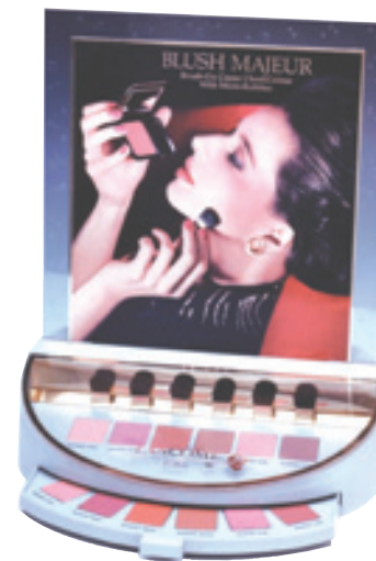
Plastic Vacuum Formed Displays with Removable Product Trays